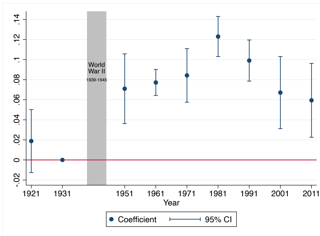
Figure 2: Event Study: Coefficients in Different Post-War Years (and Pre-Trend Test)

Notes: Coefficient estimates using specification of column 5, Table 2, for different time periods (with 95% confidence intervals). Dependent variable is district's share of employment in modern sectors (industry and services). For list of control variables and other details, see Table 2. In regressions for post-war periods, pre-war (reference) year is 1931, and post-war year is either 1951, 1961, 1971, 1981, 1991, 2001, or 2011. Figure also shows “pre-trend” test using data from 1921 and 1931, with 1931 as reference year for purpose of this figure (coefficient is identical to but opposite in sign of coefficient in column 6 of Table 2).